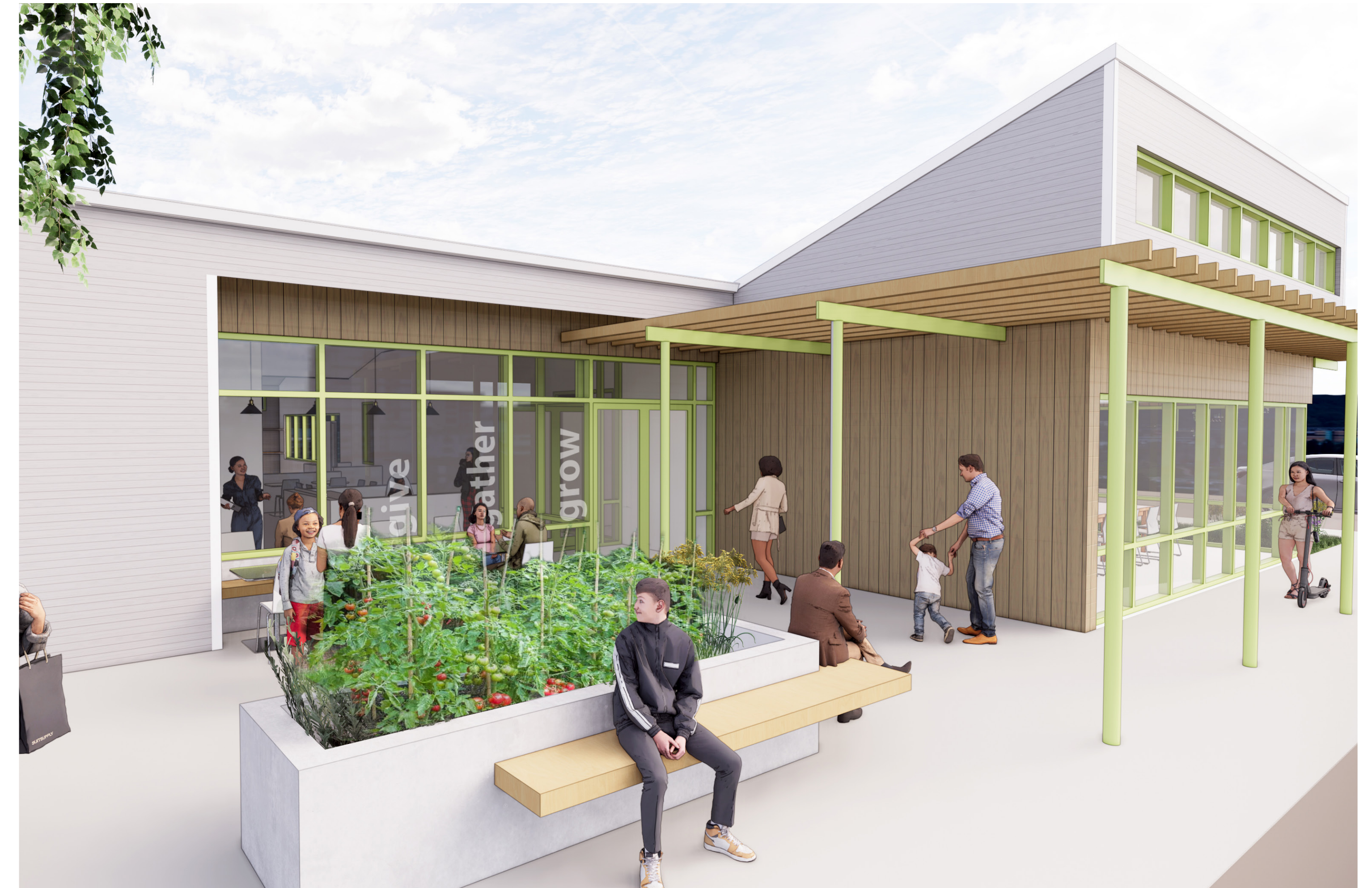
SOUTH KITSAP HELPLINE - NON-PROFIT FOOD BANK SERVING 9,000+ HOUSEHOLDS PER YEAR

Food banks remain the first line of defense in fighting food insecurity but new approaches include choice models for food selection, on-site programming and the integration of community resources.