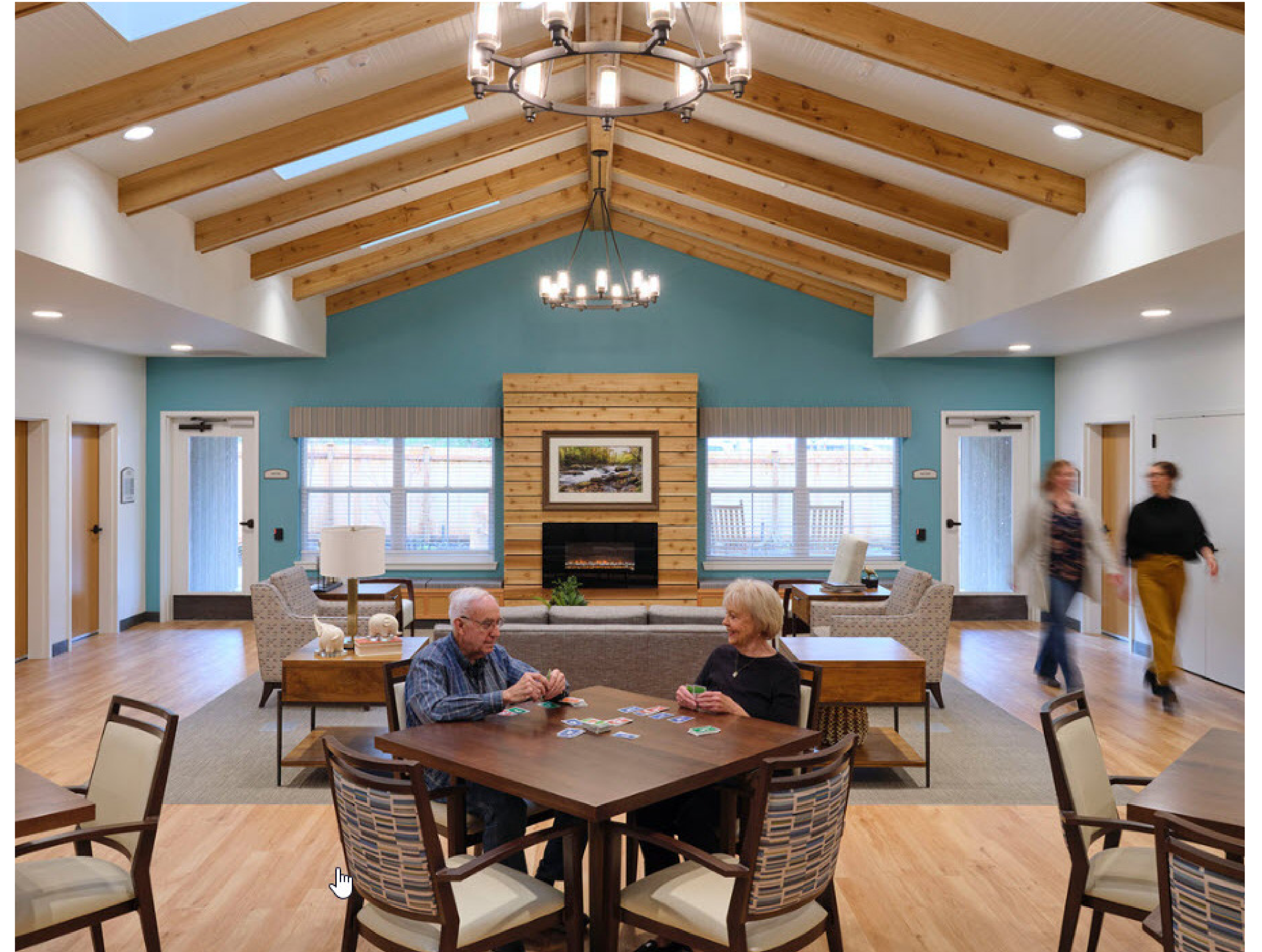
THE MUSTARD SEED VILLAGE - ASSISTED LIVING COMMUNITY ON THE KEY PENINSULA

Access to family, social activities, and autonomy are fundamental factors in quality of life for aging populations. Design can improve quality of life and mental health through opportunities for personalization, privacy, access to nature and natural daylight.