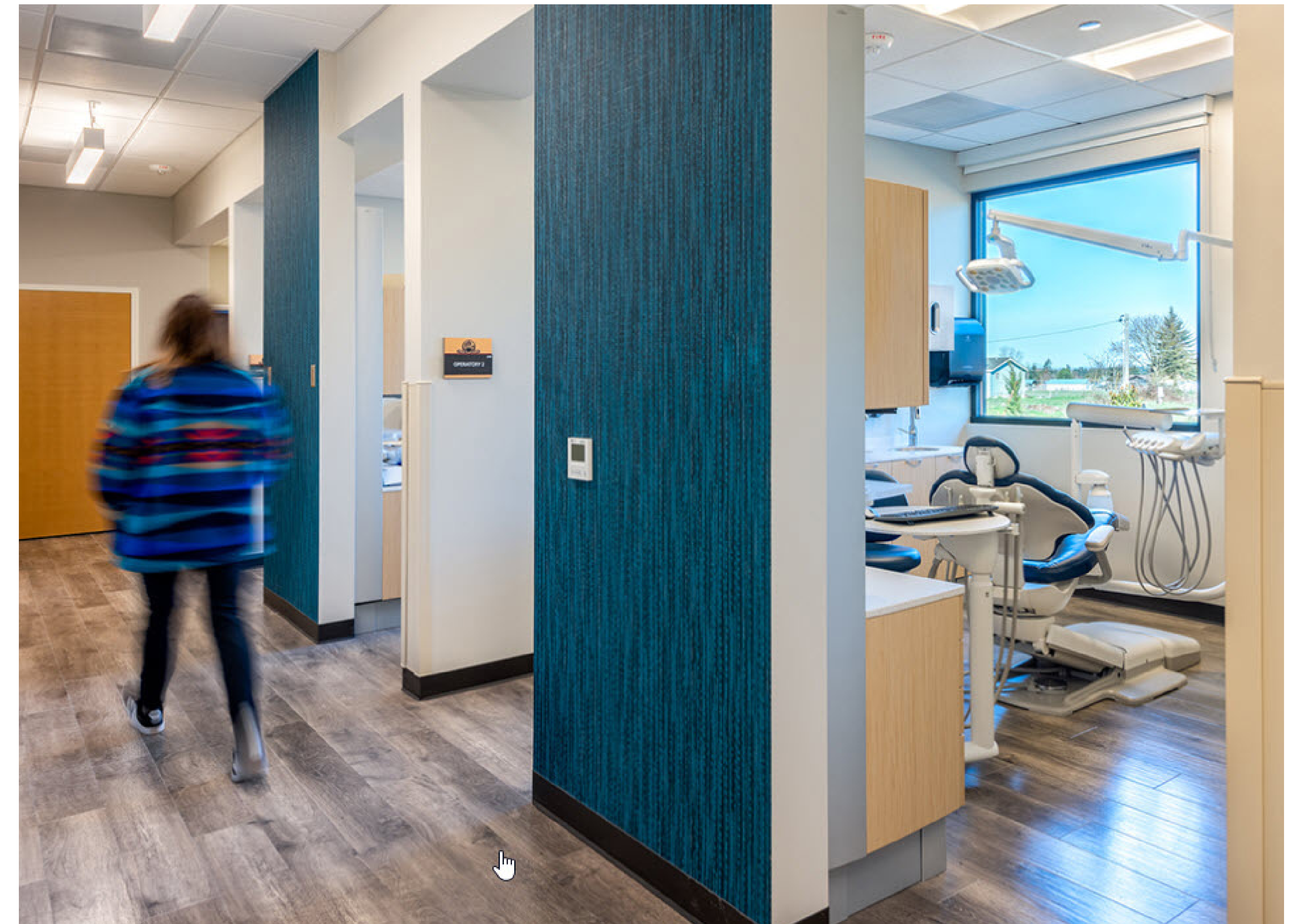
JAMESTOWN S'KLALLAM HEALING CLINIC - MAT FACILITY WITH RECOVERY ECOSYSTEM INCLUDING PRIMARY CARE, COUNCELING AND SOCIAL SERVICES

The recovery ecosystem model was created to address the opioid epidemic and focuses on providing overlapping resources and support for multiple facets of recovery.